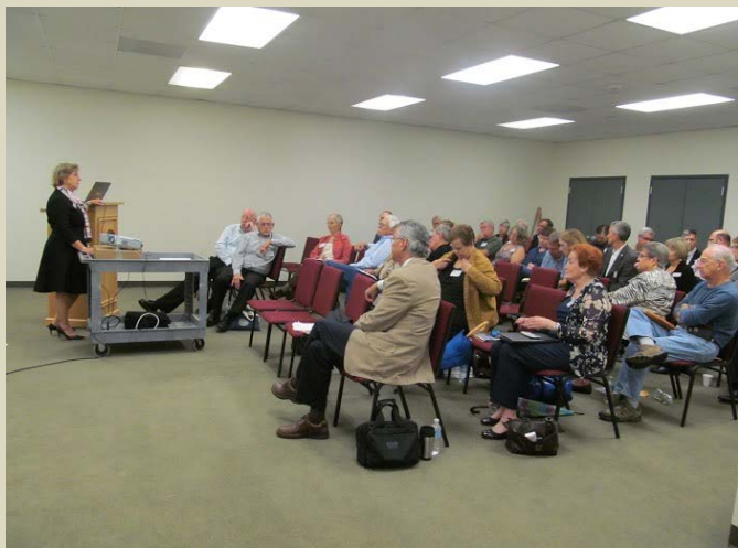
2015 Fall Symposium (October 24, 2015)